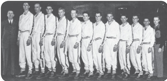
1946-47 — OSU's First NCAA Tournament Team