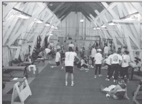
The top floor of "The Barn" contains a weight/circuit training facility and 30 ergometers.