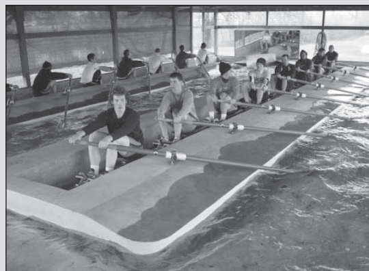
Constructed in 1999, OSU's 16-person rowing tank is located behind the main boathouse. Oregon State is the only university on the West Coast with tanks.

In Corvallis, the Beavers practice on the Willamette River, which borders the east side of town. OSU hosts races in Vancouver, Wash., on the waters of Vancouver Lake and near Eugene, Ore. at Dexter Lake.