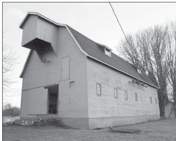
"The Barn," built in 1907, sits adjacent to the OSU Boathouses and locker rooms. The building is a complete land-based training facility with ergometers, weights and a classroom for video analysis.

Oregon State University enjoys one of the nation's finest rowing facilities, located just one mile from campus. The main boathouse has two storage bays and a workshop bay, along with a fully equipped athletic training facility. The boathouse has storage room for 28 eights and oars. The shop bay is equipped to handle anything from minor repairs to major restoration of wooden and composite shells. The small boathouse has storage for 10 fours, 12 pairs, and eight singles.