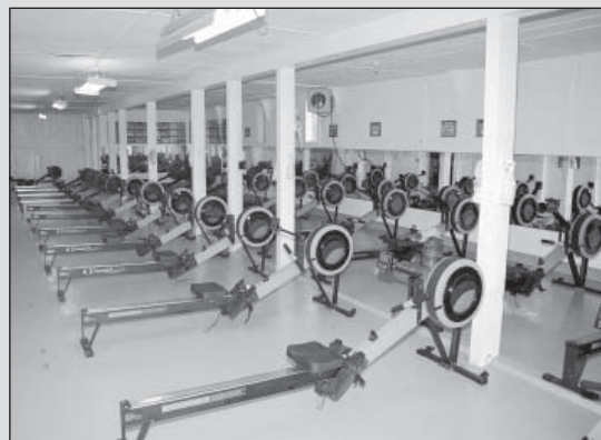
Located on the first floor of "The Barn" is OSU's ergometer training room. The room houses 30 Concept II Ergometers.